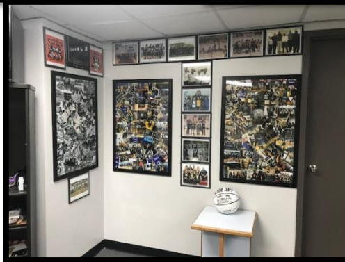
Check it out!