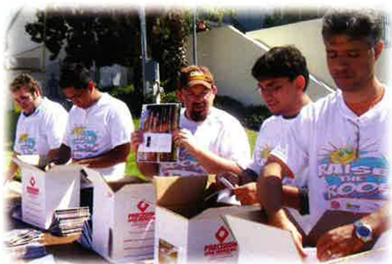
Trinity Students Hard at Work

had 30 volunteers who had the opportunity to work with other Christians from different denominations and learn what it is like to truly do something for someone else, receiving nothing in return. Trinity was the host site for the event, which meant that we would have lunch ready for a hungry crew. We served approximately 100 people from the community and heard the stories of how God had used this event to touch the hearts of those that worked and those that received the help. It was a great success.