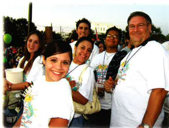
Trinity Staff and Students at Raise the Roof

This year Trinity College participated in Somebody Cares Tampa Bay . Somebody Cares Tampa Bay was established to unify and empower the Church across denominational and racial lines, utilizing all the key components that are needed to effectively reach and evangelize the Bay Area for Christ. Somebody Cares has equipped and supplied the Church with resources through many projects and events. By combining resources, we have been able to do more together than apart and significantly increase our effectiveness in reaching the Bay area. It is a one-day event in which churches and businesses across the Tampa Bay area are united to go out into the community and show the love of Christ by helping people in need. This year eleven cities were involved, two thousand four hundred and twelve volunteers came out to lend a hand in the one hundred and seventy-five different projects in fifteen different communities. We are so grateful for all the hard work that went into this year's event. It would not have been so successful without the commitment of everyone involved. In Pasco County where Trinity College participated, there were approximately 150 volunteers. These volunteers painted three houses, cleaned up Bayonet Point Middle School, and cleaned up other properties, as well as performing many other home repairs. Trinity College (a major sponsor)