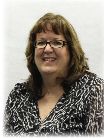
TBD Vice President for Business and Finance